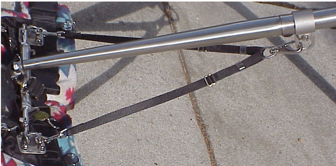
Side view of a proper V-Brace connection

It ALSO prevents the weaker dog from being pushed backwards by the 2DH when the stronger dog pulls harder. I.e. it keeps them equal.